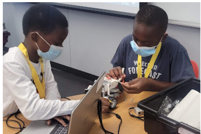
Working together on EV3 Robots