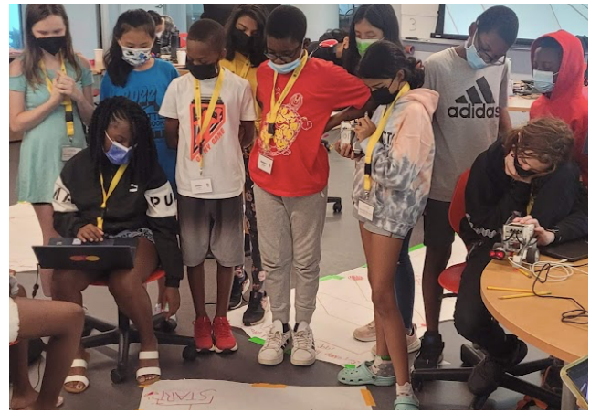
Creating a maze

We're excited for another great week and are looking forward to going to the American Visionary Arts Museum on Thursday!