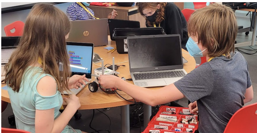
Working together on EV3 Robots